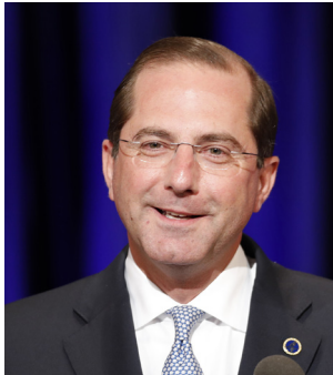
U.S. Department of Health and Human Services Secretary Alex M. Azar II