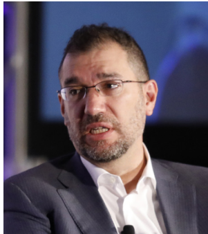
Andy Slavitt, former acting administrator, Centers for Medicare & Medicaid Services, and senior adviser, Bipartisan Policy Center