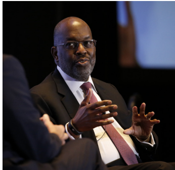
Bernard J. Tyson, chairman and CEO, Kaiser Permanente